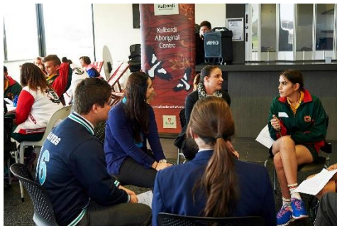
Deadly Dreaming 2016