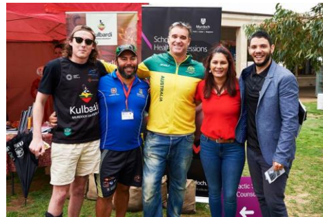
Warlang Health Festival